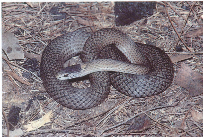
Foto 15: Drysalia rhodogaster (Jan & Sordelli, 1873), eastern masters' snake, Lithgow, NSW; foto R.T. Hoser.