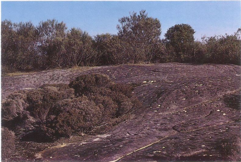
Foto 13: Kurringai Chase habitat, + 25 km north of Sydney, bushland, 5 km north of Salvation Creek (West Head). Woeste streek, 5 km ten noorden van Salvation Creek.