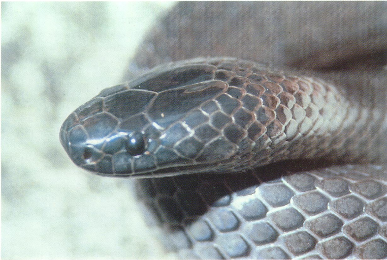
Foto 10: Cryptophis nigrescens (Gunther, 1862), small-eyed snake, kleinoog slang, Port Douglas, Qld; foto R.T. Hoser.