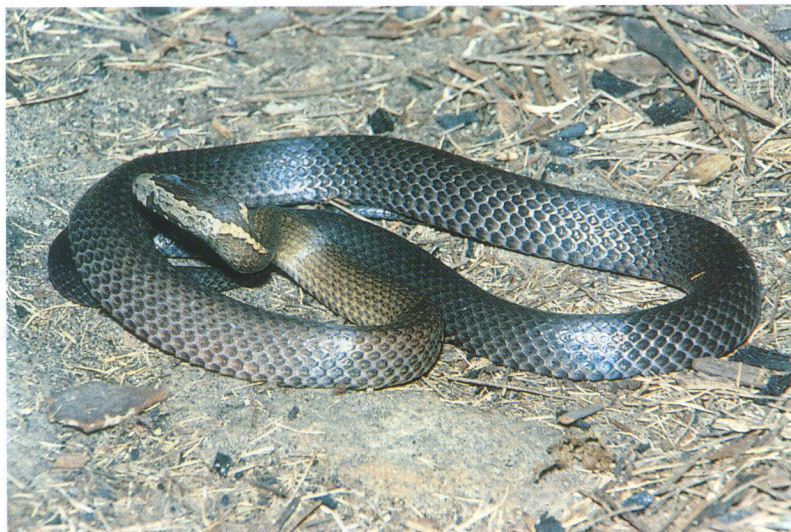
Foto 9: Cacophis squamulosus (Dumeril, 1854), golden crowned snake, goudenkroon slang, St. Ives, NSW; foto R.T. Hoser.