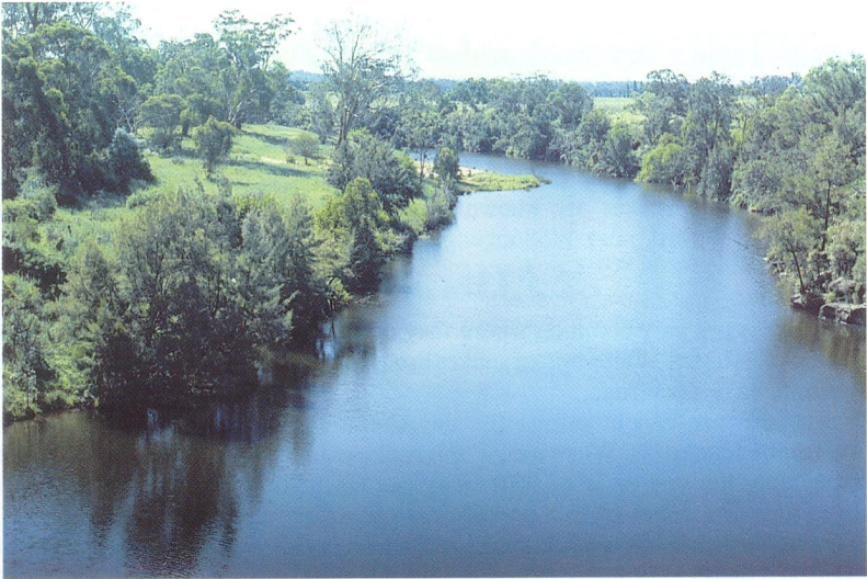
Foto 12: Nepean River habitat, + 60 km south-west of Sydney, on the outer edge of the relatively flat Cumberland plain, aan de rand van de relatief vlakke Cumberland vlakke; foto R.T. Hoser.