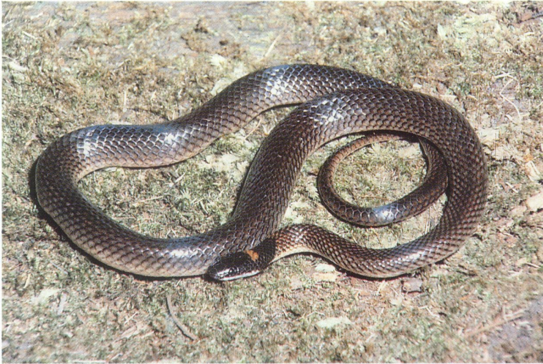
Foto 16: Furina diadema (Schlegel, 1837), red-naped snake, roodnek slang, West Head, NSW; foto R.T. Hoser.