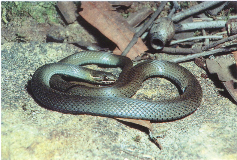
Foto 17: Hemiaspis signata (Jan, 1859), swamp snake, moerasslang, male, man, Northbridge, NSW; foto R.T. Hoser.