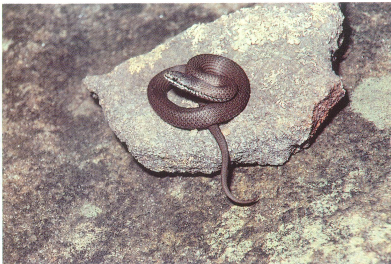
Foto 14: Drysalia coronoides (Gunther, 1858), white-lipped snake, witlipslang, juv., Snowy Mountains, NSW; foto R.T. Hoser.