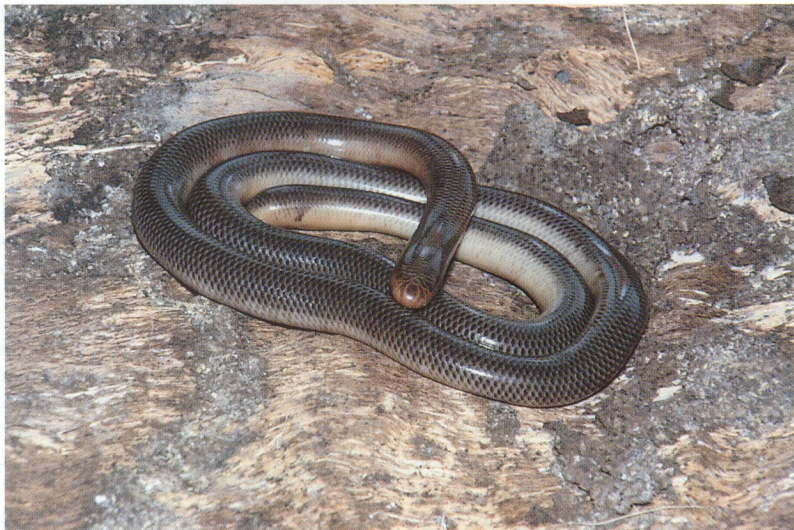
Foto 4: Typhlina proximus (Waite, 1893), blind snake, blinde slang, Terrey Hills, NSW; foto R.T. Hoser.