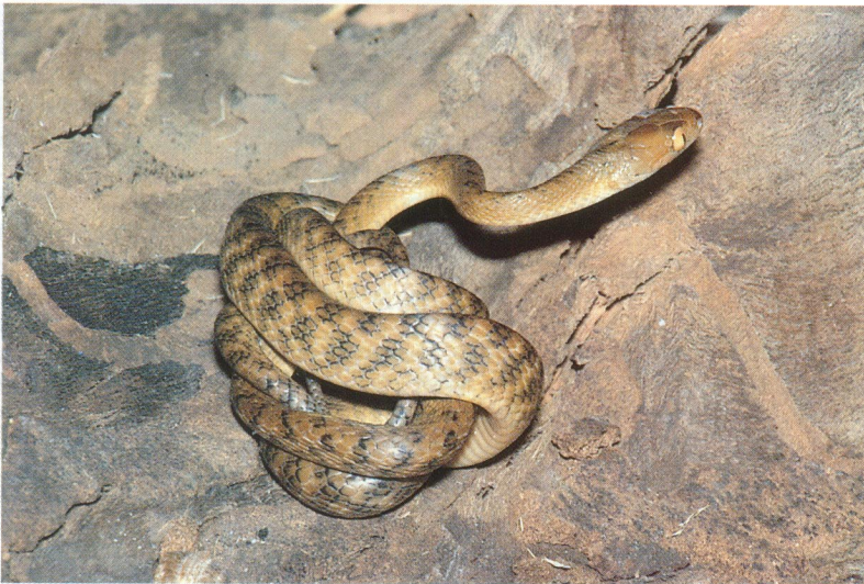
Foto 6: Boiga irregularis (Merrem, 1802), brown tree snake, ± 1.2 m, bruine boomslang, West Head NSW; foto R.T. Hoser.