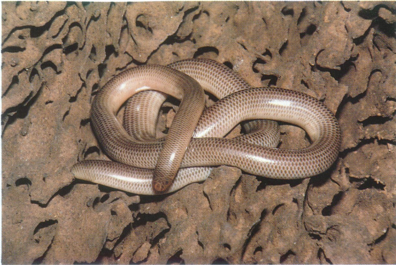
Foto 3: Typhlina nigrescens (Gray, 1854), blind snake, blinde slang, Cottage Point, NSW