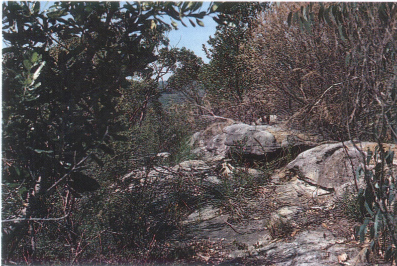
Foto 2: Kurringai Chase habitat, Terrey Hills, + 25 km north of Sydney. The rocky sandstone habitat with crevices and exfoliations provides optimal habitat for many types of reptiles including snakes. Het rotsachtige zandsteen gebied met zijn spleten en geërodeerde rotsen vormt een optimaal biotoop voor veel reptielen soorten, inclusief slangen; foto R.T. Hoser.