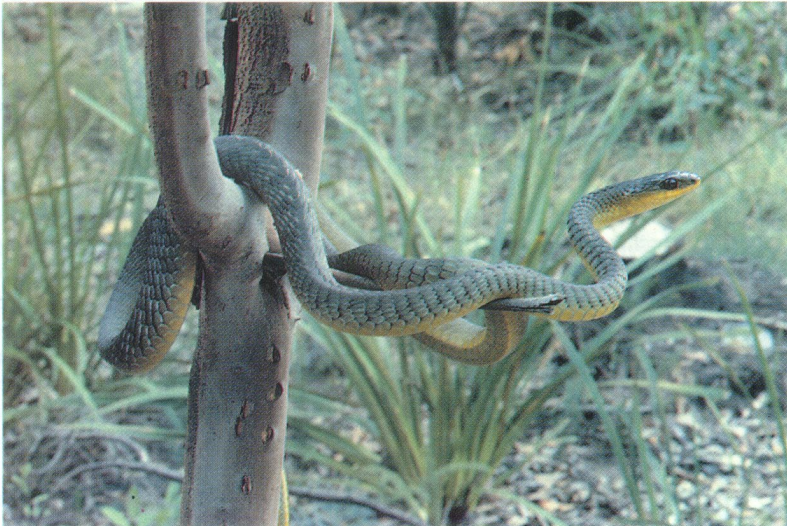
Foto 7: Dendrelaphis punctulatus (Gray, 1826), green tree snake, groene boomslang, St. Ives, NSW; foto R.T. Hoser.

Worm snakes (both species) are commonly found in all parts of Sydney including the inner north shore and eastern suburbs.