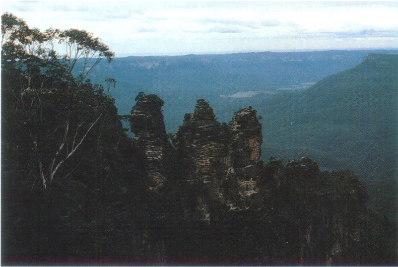
Foto 1: Three Sisters, + 100 km west of Sydney in the Blue Mountains, KatOomba. Copperheads and White-lipped snakes are found here. Koperkoppen en witlip slangen komen hier voor; foto R.T. Hoser.