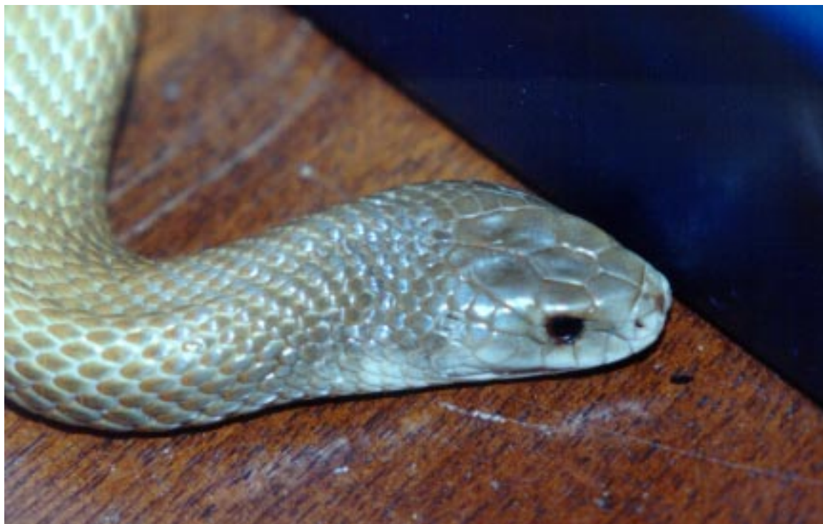
Pailsus rossignolii sp. nov. from Merauke, Irian Jaya