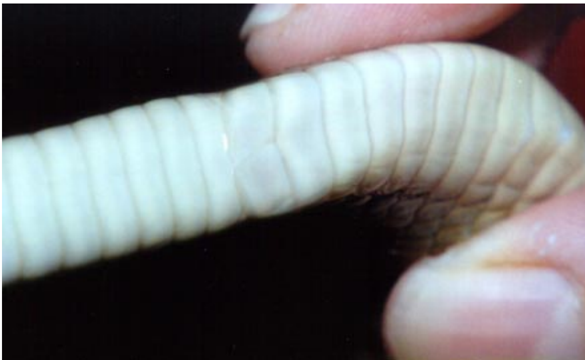
Pailsus rossignolii sp. nov. from Merauke, Irian Jaya